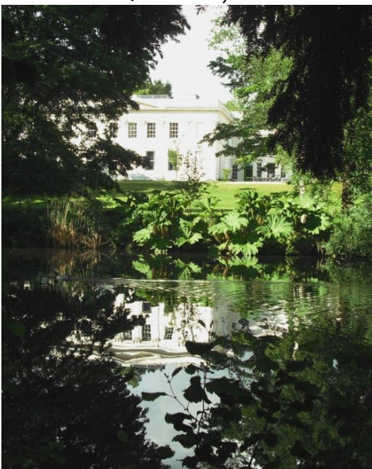
Woodbrooke Quaker Study Centre